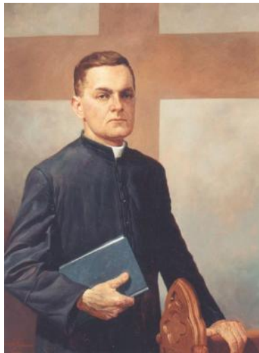
Father McGivney Pray for Us

Meetings are held on the 1st and 3rd Tuesdays of each month in the Council Hall located at the intersection of Morton Street and Garity Place. The mailing address is 1 Morton Street, Farmingdale, NY 11735-4340. The deadline for material for publication in the Mariner is the Friday that follows the 3rd Wednesday of the prior month. PLEASE keep this deadline in mind for articles you wish to have publish in the Mariner.