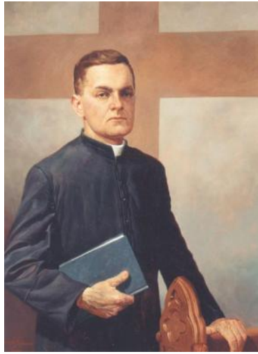
Father McGivney Pray for Us

Meetings are held on the 1st and 3rd Tuesdays of each month in the Council Hall located at the intersection of Morton Street and Garity Place. The mailing address is 1 Morton Street, Farmingdale, NY 11735-4340. The deadline for material for publication in the Mariner is the Friday that follows the 3rd Wednesday of the prior month. PLEASE keep this deadline in mind for articles you wish to have publish in the Mariner.