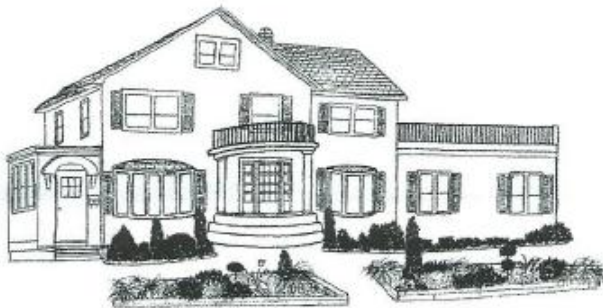
Bethpage 234 Broadway, Bethpage (516) 931-1454