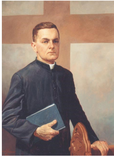
Father McGivney Pray for Us

Meetings are held on the 1st and 3rd Tuesdays of each month in the Council Hall located at the intersection of Morton Street and Garity Place. The mailing address is 1 Morton Street, Farmingdale, NY 11735-4340. The deadline for material for publication in the Mariner is the Friday that follows the 3rd Wednesday of the prior month. PLEASE keep this deadline in mind for articles you wish to have publish in the Mariner.