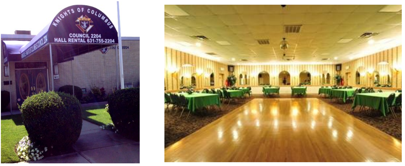
Looking for a place to host a birthday party or a first Communion or just getting the family together to have a good time? Our Farmingdale Catholic Center hall is available for rentals all year round. With a cozy atmosphere, stylish decor, seating for 120, and convenient location just off Route 109, we have everything your party needs.